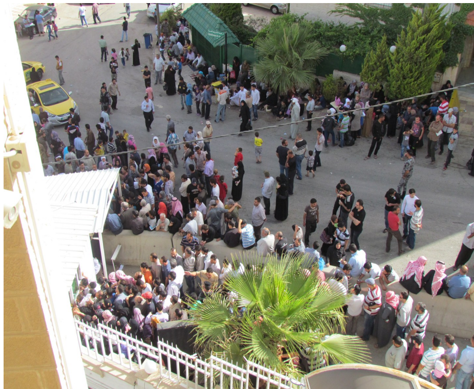
Syrian refugees waiting to be registered with the local UNHCR office in Amman, Jordan, June 2013

As the Syrian civil war enters its third year, the human cost of the conflict is growing exponentially. According to the UN, as of July 2013 more than 100,000 Syrians are dead, more than 4.5 million are internally displaced, and more than 1.7 million are refugees in neighboring countries. By the end of 2013, more than half of Syria's population, over 10 million people, likely will need urgent humanitarian assistance.